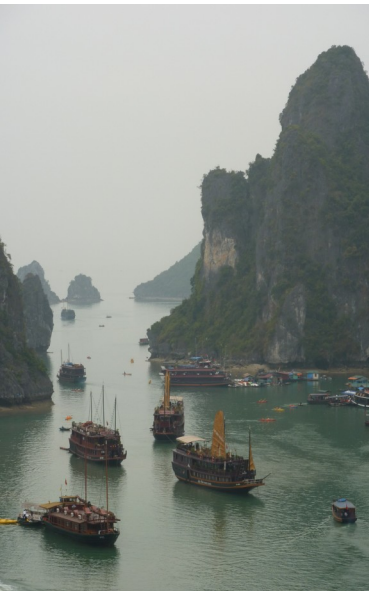
Traditional Junk— Halong Bay

Vietnam was everything I hoped it would be and I can't wait to go back. If you have been thinking about getting there yourself, I would suggest getting there sooner rather than later as it is going to change dramatically in the next few years.