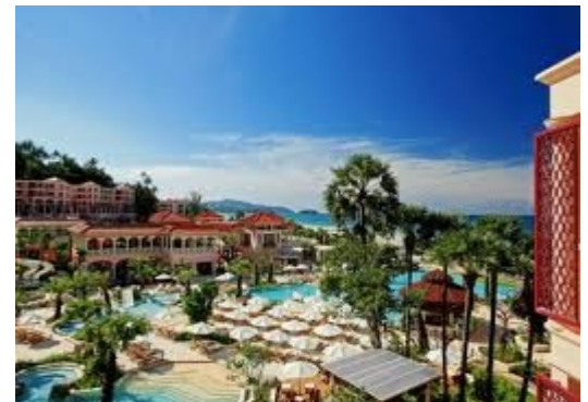
The Centara Grand Resort and Spa, Karon Beach

Hidden Secret – If you are wanting a Resort Holiday in Phuket but shopping just isn't your thing, then the newly opened Indigo Pearl Phuket could be the destination for you.