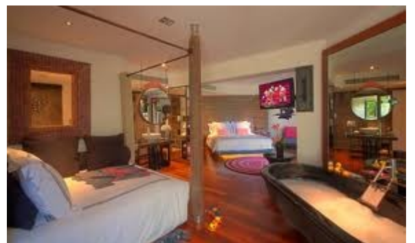
DB Suite at Indigo Pearl