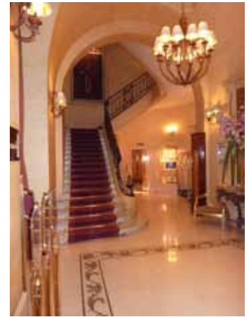
Foyer Lotti Hotel Paris

Paris is such a large city that sometimes its worth paying the little extra to get the "Location, Location, Location" and both of the above hotels certainly offer you that.