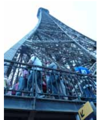
Eiffel Tower from a different View.

There are plenty of English speaking staff to assist you with anything you are unsure of. The service on the trains is excellent and trains very clean. The first class rail passes that we can purchase from Australia are well and truly worth it, at some stations they even have a first class lounge that you can wait in and have complimentary refreshments.